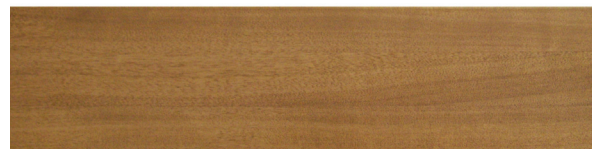
112 mm (4 3/8 in) slat.