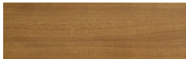
137 mm (5 3/8 in) slat.